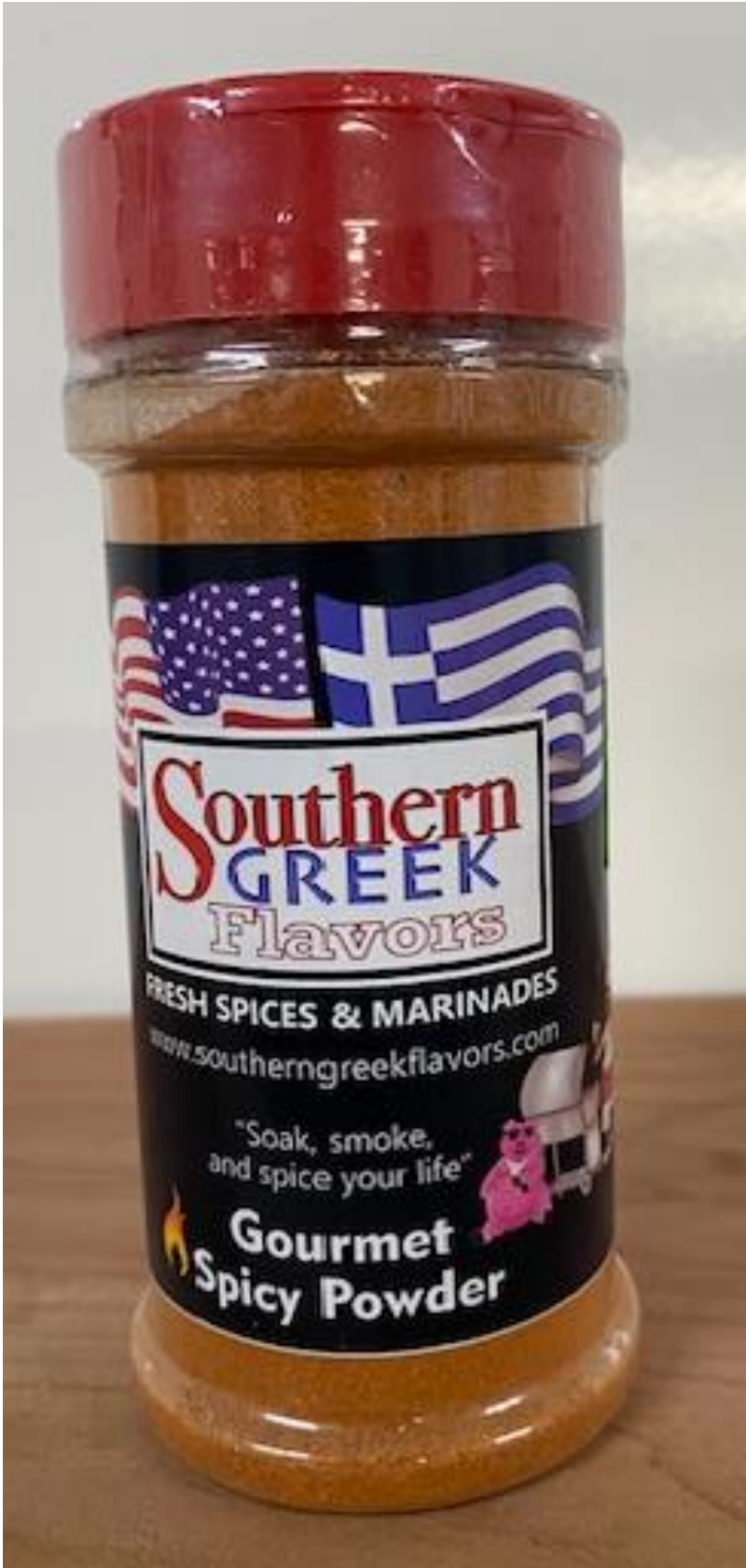
Gourmet Spicy Powder $10.00