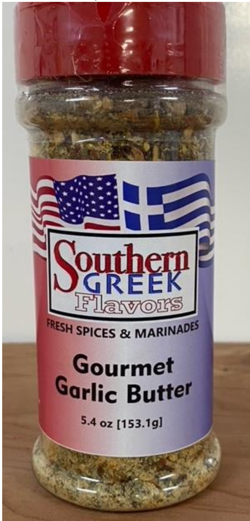
Gourmet Garlic Butter $10.00