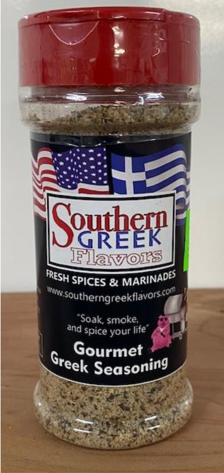
Gourmet Greek Seasoning $10.00