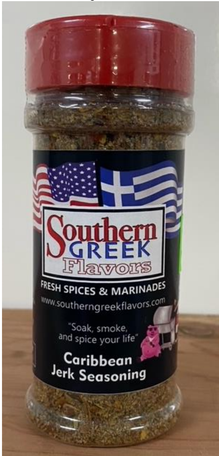
Carribean Jerk Seasoning $10.00