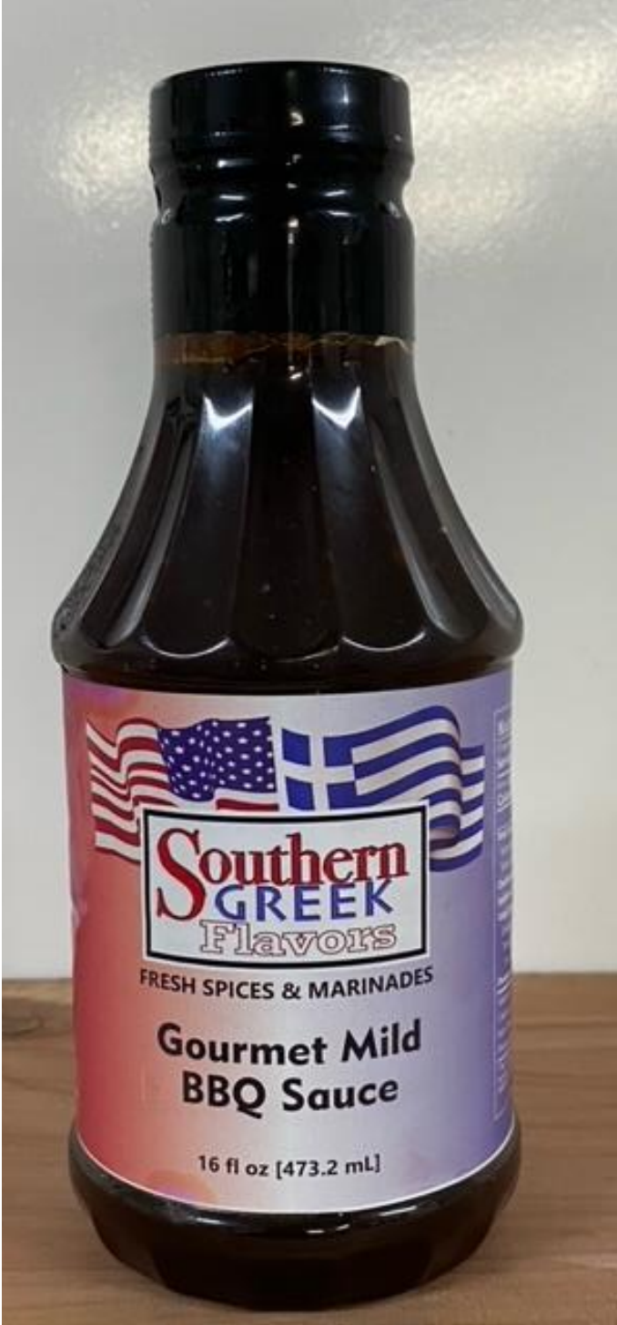
Gourmet Mild BBQ Sauce $10.00